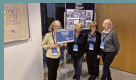
BSc Dietetics, Class of 1984