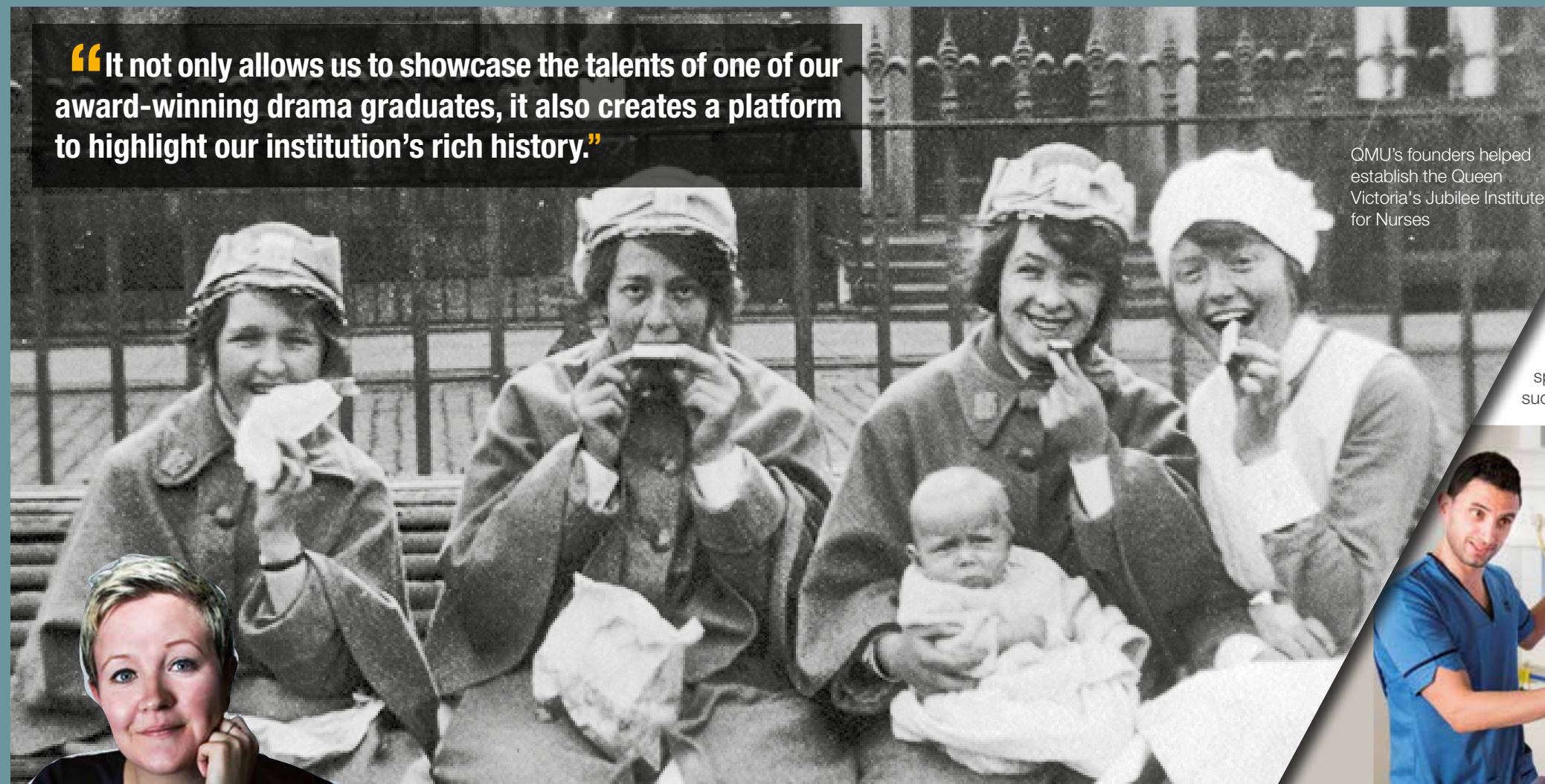
QMU's founders helped establish the Queen Victoria's Jubilee Institute for Nurses

“It not only allows us to showcase the talents of one of our award-winning drama graduates, it also creates a platform to highlight our institution’s rich history.”