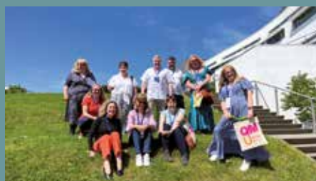
Diploma in Podiatric Medicine, Class of 1991

Last year, we welcomed many of our alumni back to campus, individually or as part of class year groups. It was great to reconnect, and have the opportunity to listen, as everyone reminisced about their student days.