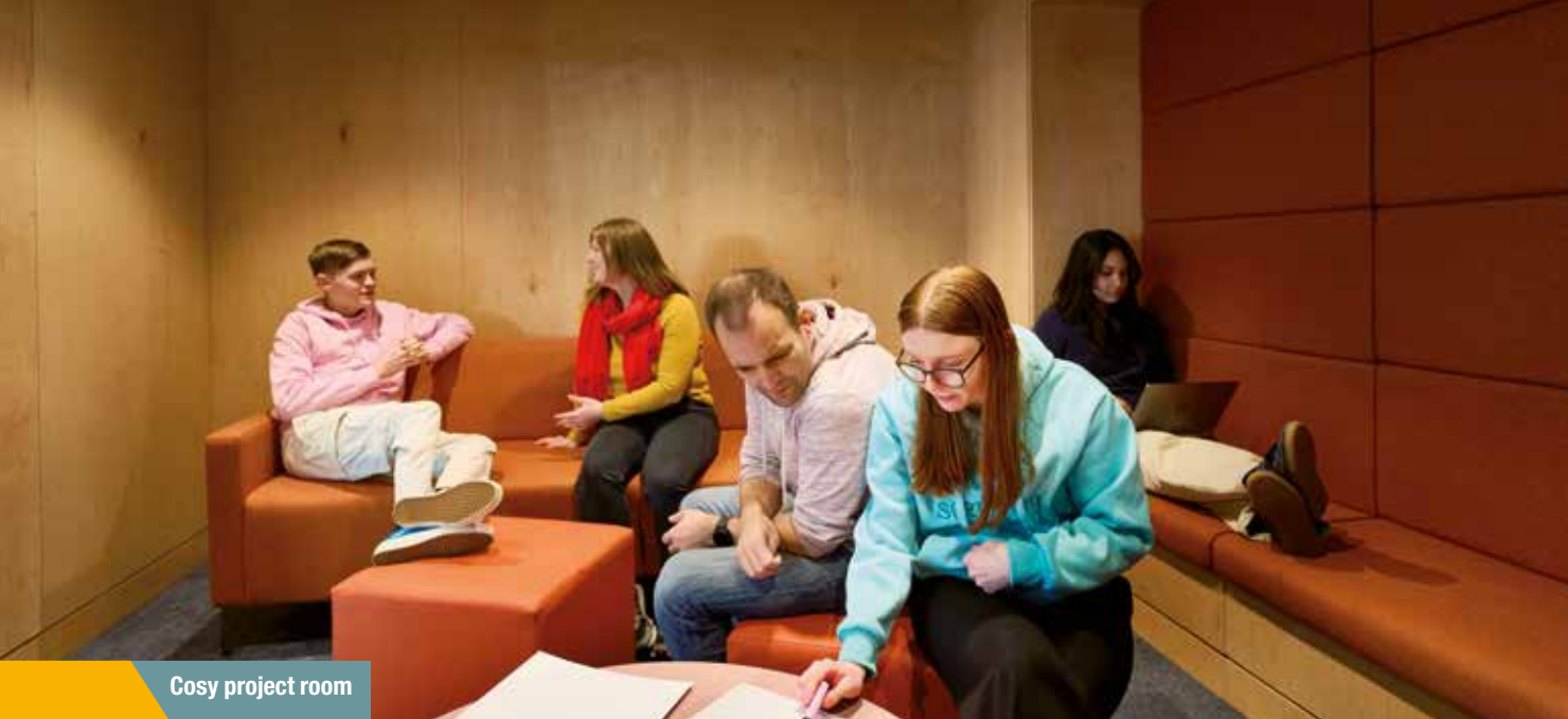
Cosy project room