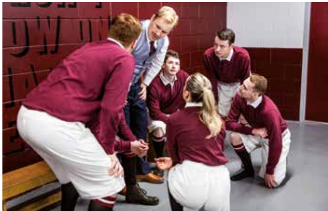
Students re-enact team huddle in Hearts' changing room

The critically acclaimed shows, 'A War of Two Halves', and 'Sweet FA', were revived in collaboration with award-winning theatre company, 'Two Halves Productions', and received five-star reviews. The cast of Sweet FA also performed at half time at the Women's Premier League Capital Cup game. □