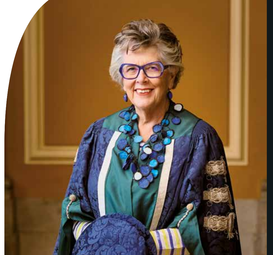
Dame Prue in her role as Chancellor at her final QMU graduation ceremony in 2024

QMU is in the process of recruiting a new University Chancellor who will continue Prue's excellent work in this important ceremonial role. □