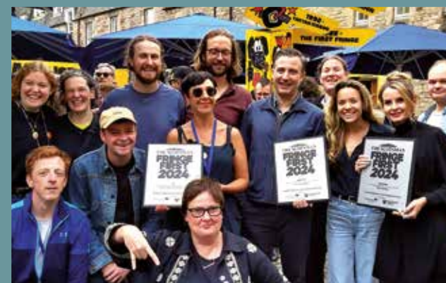
Winners of the Scotsman Fringe Festival First Awards gather at the Pleasance