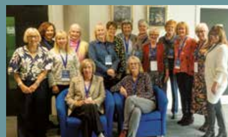
Diploma in Dietetics (and Catering), student intake 1974