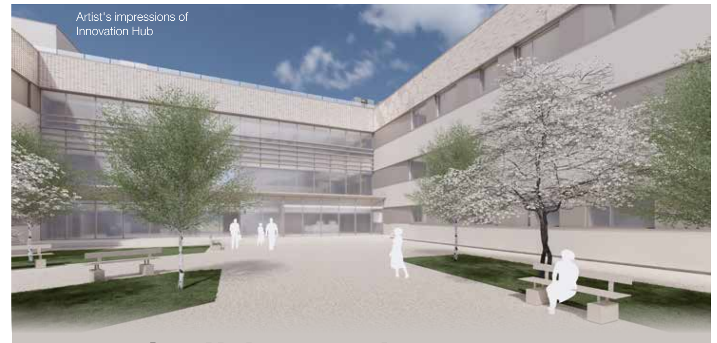
Artist's impressions of Innovation Hub

You don't need to do everything by yourself. The BRT team is here to support you, so get the specialist help you need to kick-start your successful entrepreneurial journey. Find out more at: www.brightredtriangle.co.uk